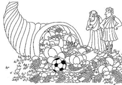
"Another cornucopia malfunction."